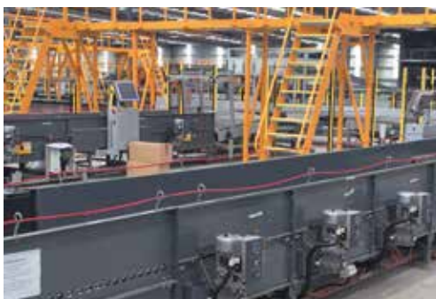
BCS solution for Toll IPEC facility Melbourne

NORD DRIVESYSTEMS – A facility of this size requires an extensive conveyor system to move parcels around within the facility. Such a system requires a significant quantity of motors and variable frequency drives. BCS chose NORD's new helical bevel series geared motors fitted with decentralized variable frequency drives for the job. "The conveyors run the delivery of all parcels to the sorter and basic distribution from the sorter as well", explained Frank Kassai, Group Engineering Manager at BCS. "We were looking at over one thousand motors and drives. They're all different sizes and range [from] 0.5 HP (0.37 kW) to 7.5 HP (5.5 kW)."